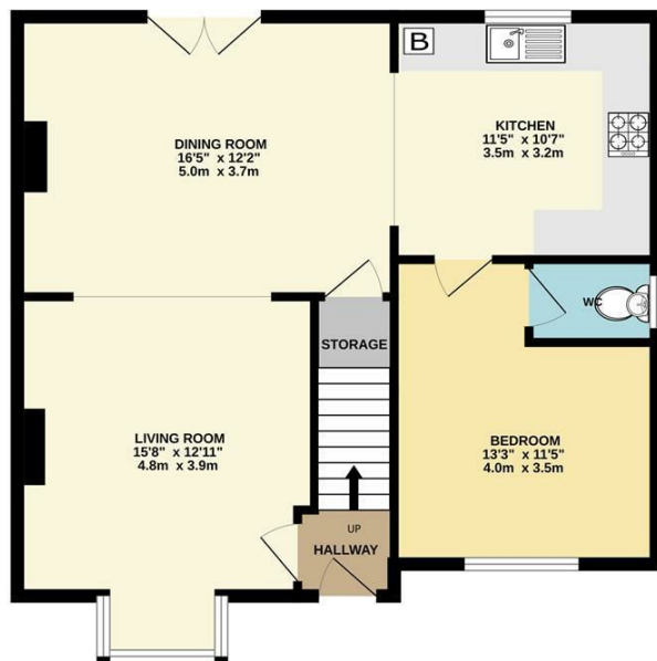
GROUND FLOOR 691 sq.ft. (64.2 sq.m.) approx.